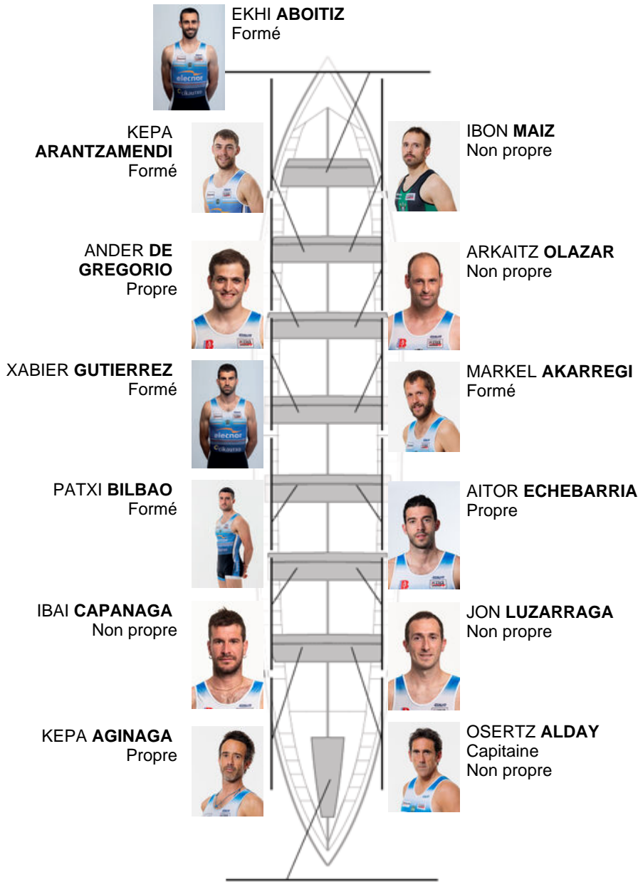
IÑAKI GOIKOETXEA Formé