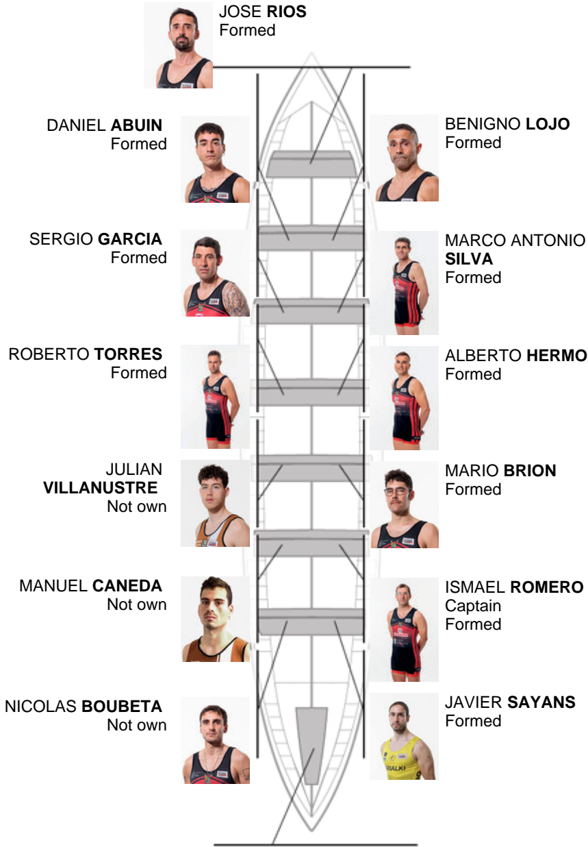
FELIX DUARTE (type unknown) Not own