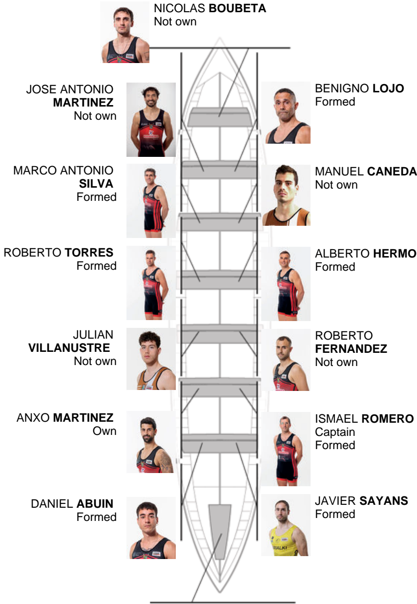
FELIX DUARTE (type unknown) Not own