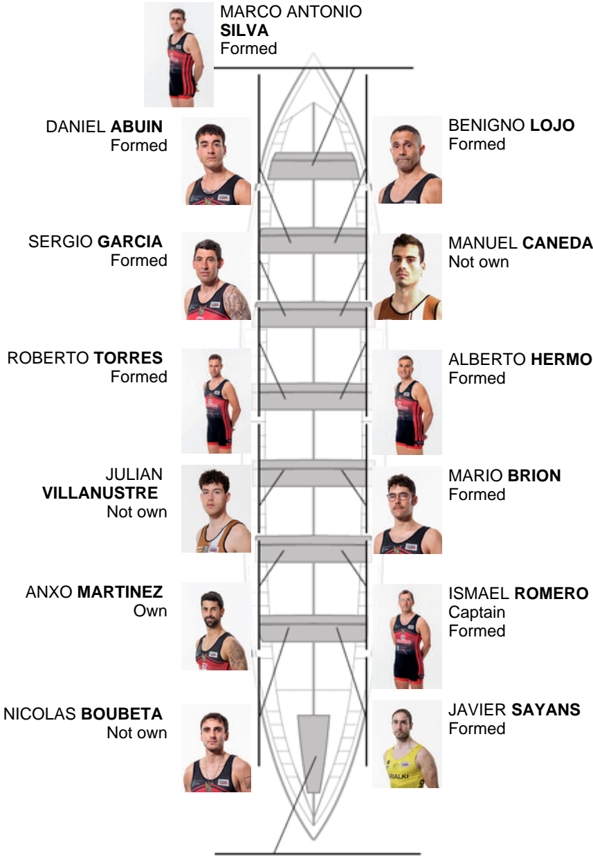
FELIX DUARTE type unknown Not own