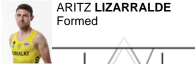
ARITZ LIZARRALDE Formed