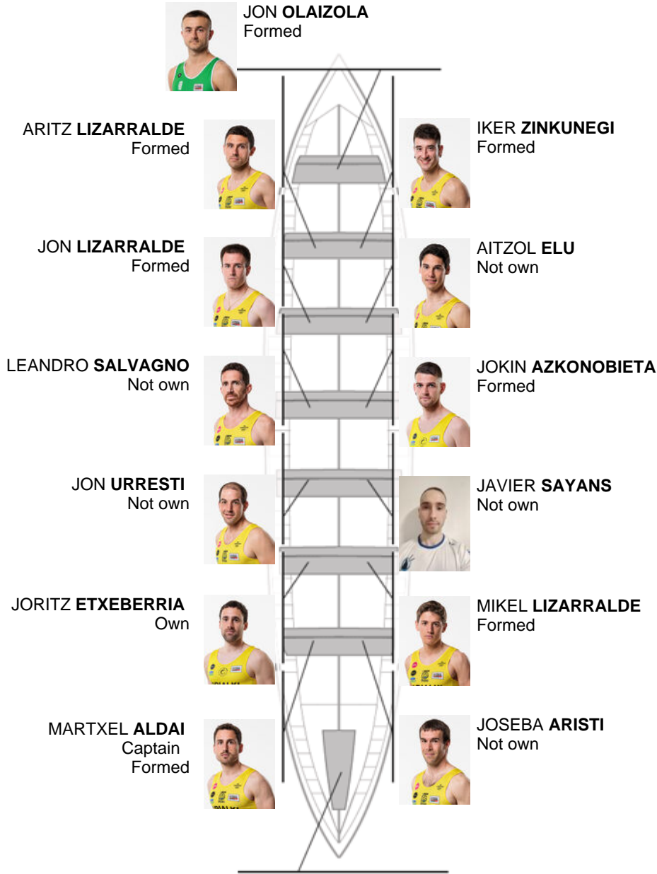
IÑIGO LARRINAGA Formed